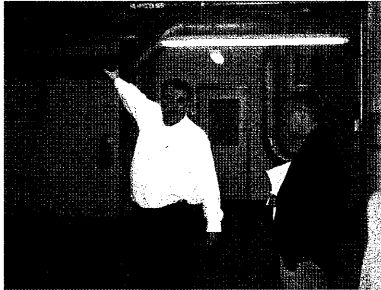
Our staff members have already met with the City of Appleton to discuss this project and gain a full understanding of what is needed to reach the City's goals.