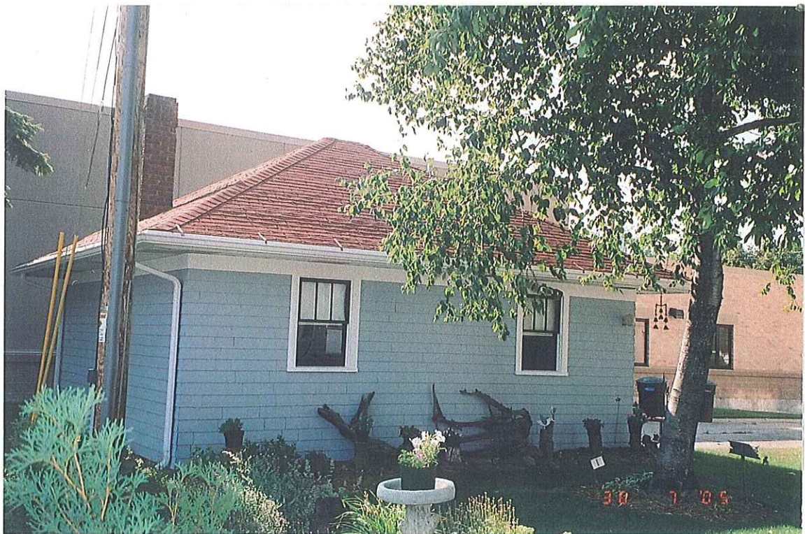
Garage - West View