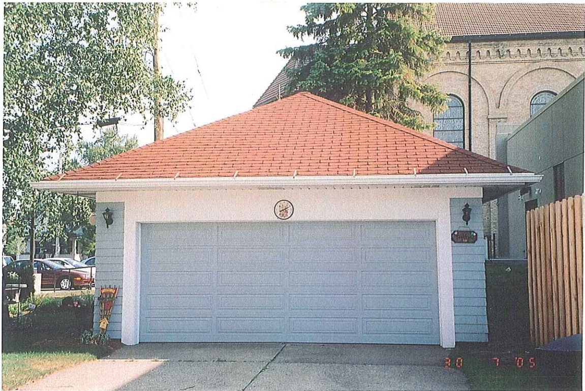
Garage - North View