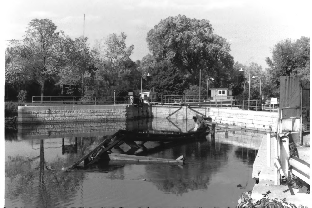
Appleton Lock & this Dist, Appleton, Outagamie County