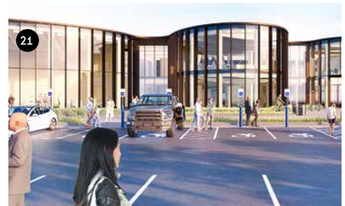
APPLETON PUBLIC LIBRARY (RENDERING BY SOM)