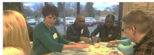
Figure 5 The "Meeting in a Box" provided a self facilitated opportunity for people to contribute to the planning process