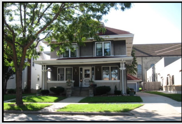
Trettin House - 523 Eighth Street

This structure is a two-family home that was constructed in 1918 and is an example of the Prairie style. The house was designed by architect Edward Wettengel Sr. It was designated as a local historic structure in 2005.