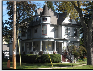
Henry Schuetter House - 330 Sixth Street