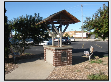
Union Springs Park Lutz Ice Company Artesian Well Site 323 Kalata Place

This is the site of the artesian well which supplied water from 500 feet underground to the Lutz Ice Company at a rate of 100 gallons per minute.